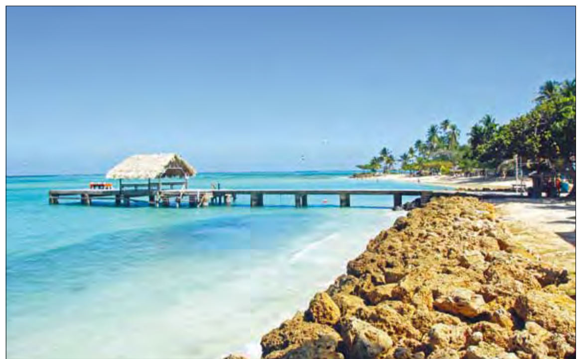
Pigeon Point beach and dyke.

"In an environment that is dynamic and competitive and so on, we are looking at brand loyalty; the type of loyalty that is based on a predictable product. We buy Coca-Cola and KFC because we are loyal to their brand. In tourism, however,